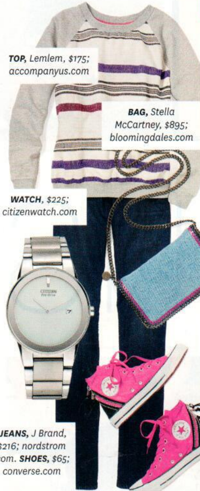
TOP, Lemlem, $175; accompanyus.com