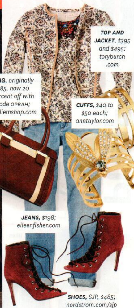
TOP AND JACKET, $395 and $495; toryburch.com